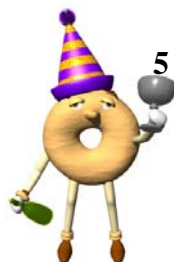
Woodrow Wood N6LGW