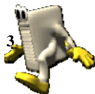
Stormy Dayton KF6BM