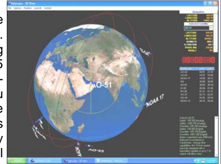
Example of Tracking Software

Back to downloads, on the first page of the www.amsat.org , you will see Downloadable Software listed; do as it says and get something on the screen. You are becoming a ham in a specialized part of ham radio now. One thing you will learn fast is the short time the bird will be in range. You may only get 15 minutes from start to finish (LOS) you must be ready and it's time to play. Afterwards the view on screen will still be seen but you are no longer in range. You will have time to continue to study on what you need to do to make it all come together with working satellites. You will be working other hams many miles away all on the VHF/UHF frequency's. The antenna's as you learn will be very important. The HT will need at times beams and outdoor views. Co-ax will need to be low loss of signal at these frequencies. The HT can work fine if you have a clear view of the bird, short feed line helps.